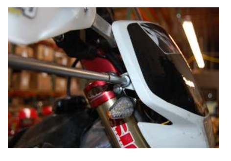
Remove upper right side clamp bolt with 10mm wrench.